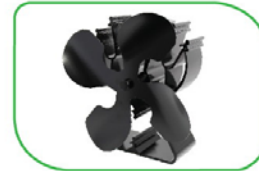
4-blade propeller design