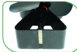
Thermal protection spring