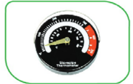
Free stove thermometer with magnetic base